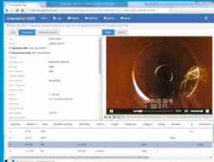
View completed inspection videos via the Internet from any browser, review tasks, run reports, filter, and search.