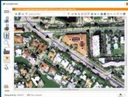
Simple. Start from a map and go!

GraniteNet Basic was designed for operators to optimize data collection. It has a simple interface to take advantage of small screens and portable computers. Main, Lateral, and Node Inspection modules can be activated independently allowing you to only purchase the features that you need.